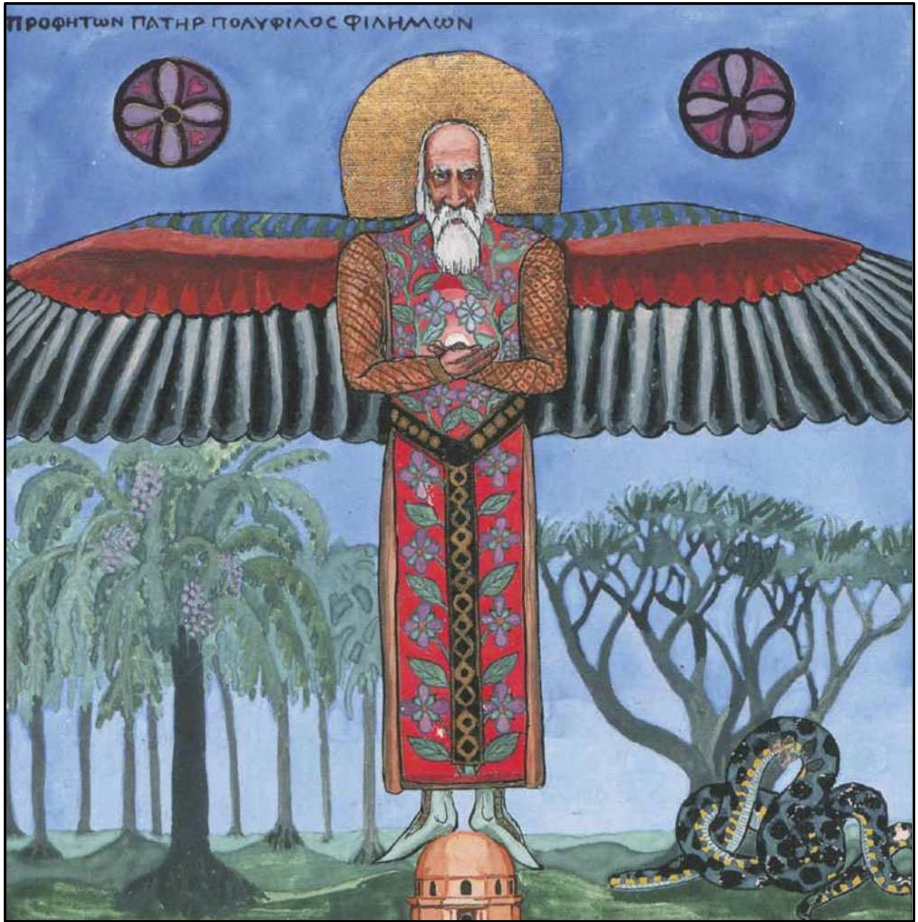
Figure 2. Philemon, as painted by Jung around 1924 in his Red Book. ( Liber Novus , folio 154.)