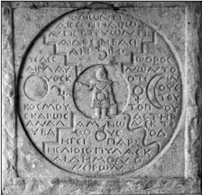
Figure 3. Jung's Aion Lapis at Bollingen, completed in 1950.

There, at the threshold of vision, we meet the final mystery of Carl Gustav Jung and his Liber Novus .