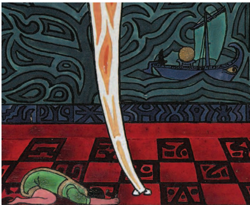
Detail, Liber Novus , Liber Secundus, folio 64.