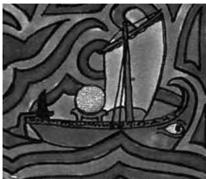
Detail, Liber Novus , Liber Secundus, folio 64.

the fourth month, has begun. “Learn from the suffering of a crucified God.” The new aeon signaled emergence of a transforming divine image. Jung had seen it.