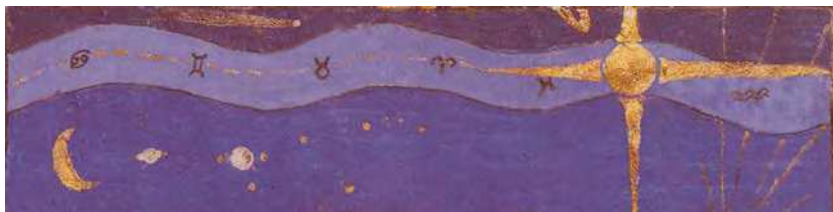
Detail from the first folio of Liber Novus , showing the zodiacal precession of the equinoxes. Liber Novus , Liber Primus, folio i recto.

The central sketch suggests a spring day with a ship setting sail on a voyage. Below, the painting reaches down through the waters of creation to primordial earth and its fiery central magma. And above, “you see the far-off forest and mountains, and above them your vision climbs to the realms of the stars” (LN, 264i).