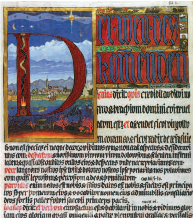
Der Weg des kommenden (The Way of What Is to Come) . The first parchment sheet of Liber Novus , composed in 1915, with Jung’s symbolic declaration of a coming new aeon. (Some paint chipping on the original parchment has been digitally restored.) Liber Novus , Liber Primus, folio i recto.