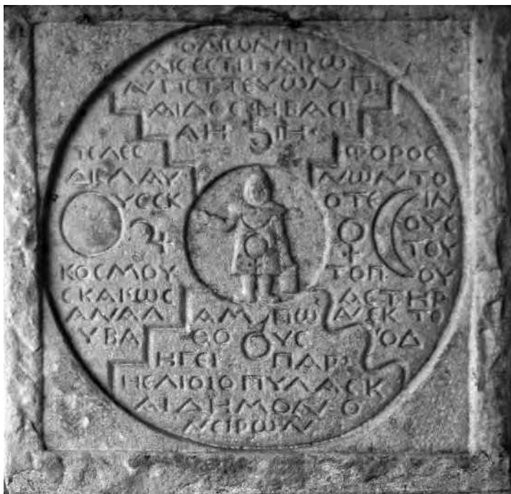
Jung's Aion Lapis , completed in 1950 and located beside his Bollingen Tower.

Aion is a child playing—Wagering on draughts—Kingship of a Child Telesphoros traverses the dark regions of this Cosmos A flashing Star from the Depths Guiding way to the Gates of the Sun and to the Land of Dreams 85